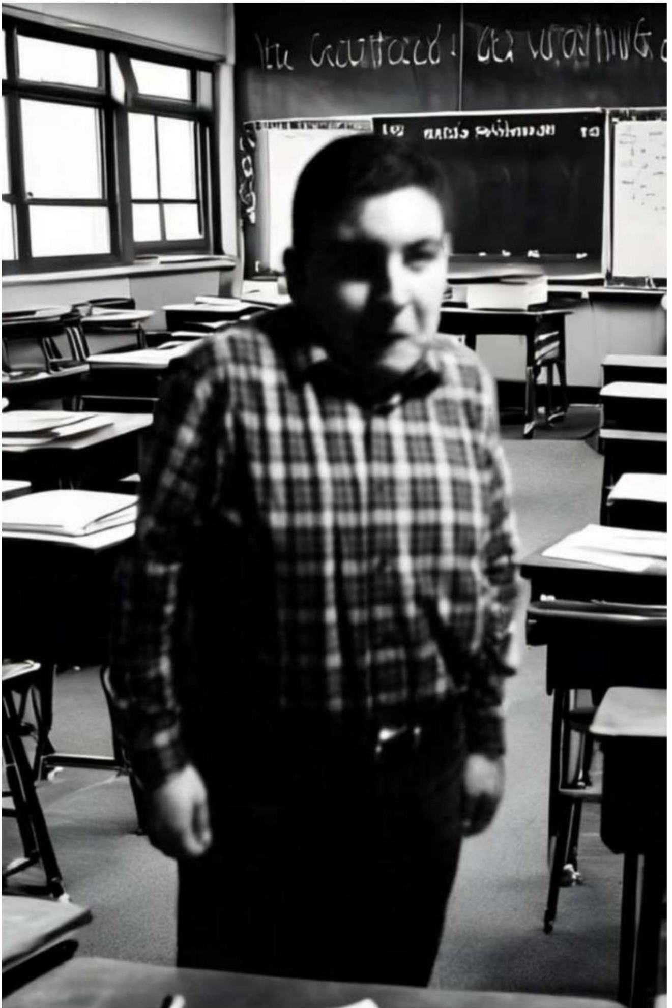
artwork omar king